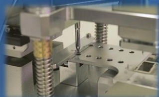
Package positioning guides